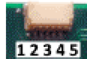
Figure 2. JST Connector on typical WifiTrax Module, pins numbered 1- 5, pin 1 has a dot.