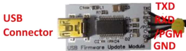
Figure 3. Connections to FWA-11